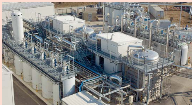
OMV Water Treatment Plant Schönkirchen, Austria